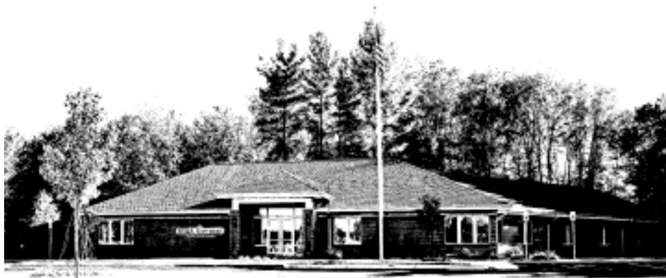
BS&A Software, home office

Looking to the future, we hope to continue to be the company you think of for your software needs. We thank you again and wish you a very happy new year!